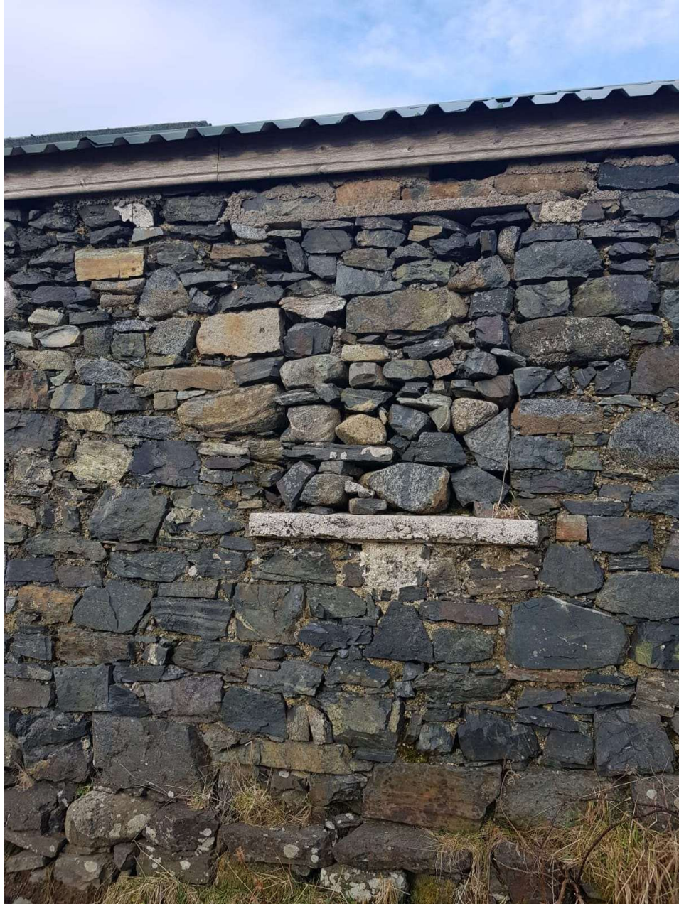
Figure 2 - Window blocked with dry stone

In 2020 3 no. existing windows, which had dry loose stone, were reopened in exactly the same configuration as they originally were. This was done by removing the stone by hand. No alterations took place to the original reveals, cills or lintels.