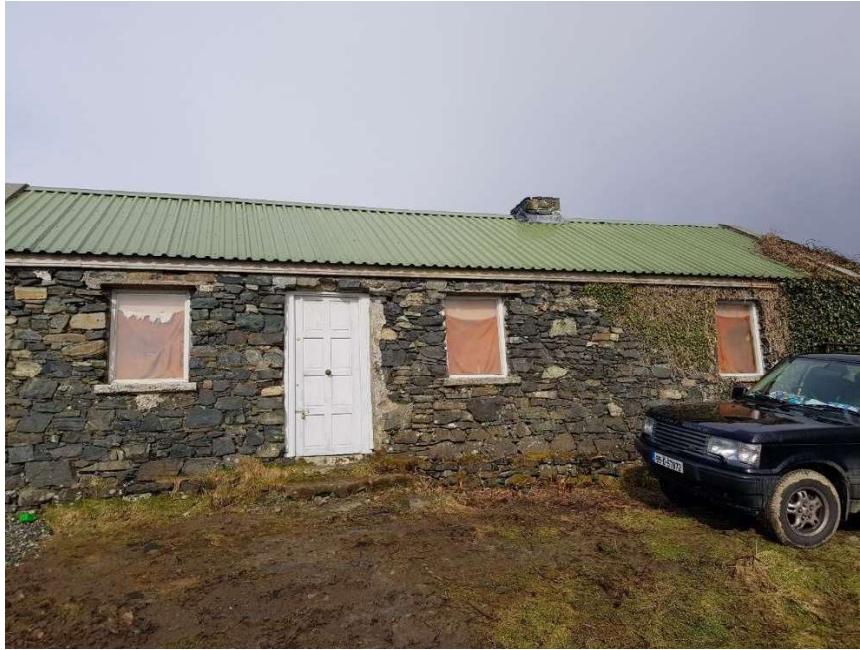
Figure 3 - Original window opes with stone removed