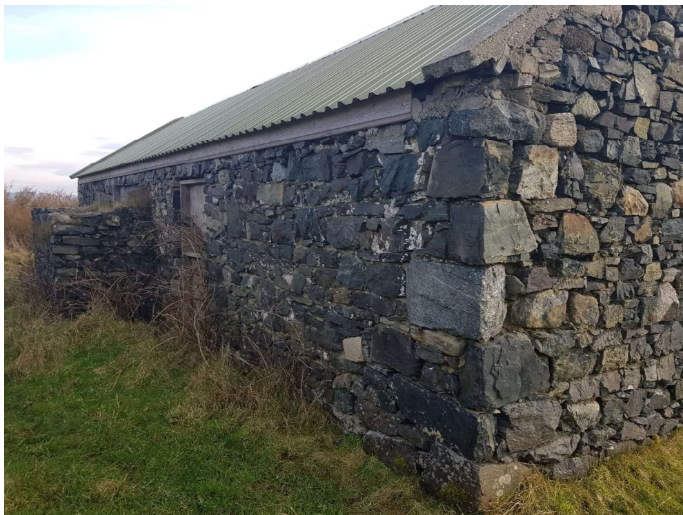
Figure 1 - Roof Sheeting fitted in the 1990's

In the 1990's an old partially collapsed corrugated metal roof was removed by hand, placed in a trailer and taken off site by tractor and trailer for appropriate disposal. Some roof timbers were retained for reuse. A small load of gravel was delivered to site by tractor and trailer. A small quantity of concrete was mixed on site on the existing floors within the building. This concrete was then lifted by hand using buckets to the top of the external walls to allow for consolidation of the walls where necessary. New roof timbers and metal sheeting were delivered to the site by tractor and trailer. The new roof timbers and sheeting were fitted by hand from ladders. No waste was generated by these works.